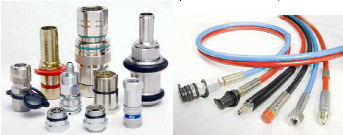
A variety of the quick connect couplings manufactured by CEJN, a Swedish company with an international reputation for quality.